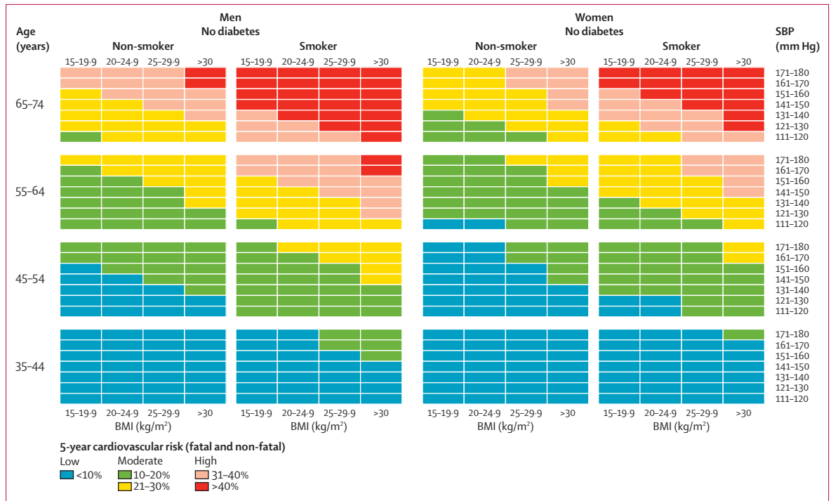
Figure 1: Risk scoring chart

How to use the chart: (1) choose the section with the patient’s sex, diabetes, and smoking status; (2) find the cell that matches the patient’s risk factor profile using age, BMI, and blood pressure; (3) refer to physician those with excessive blood pressure (>180 mm Hg).