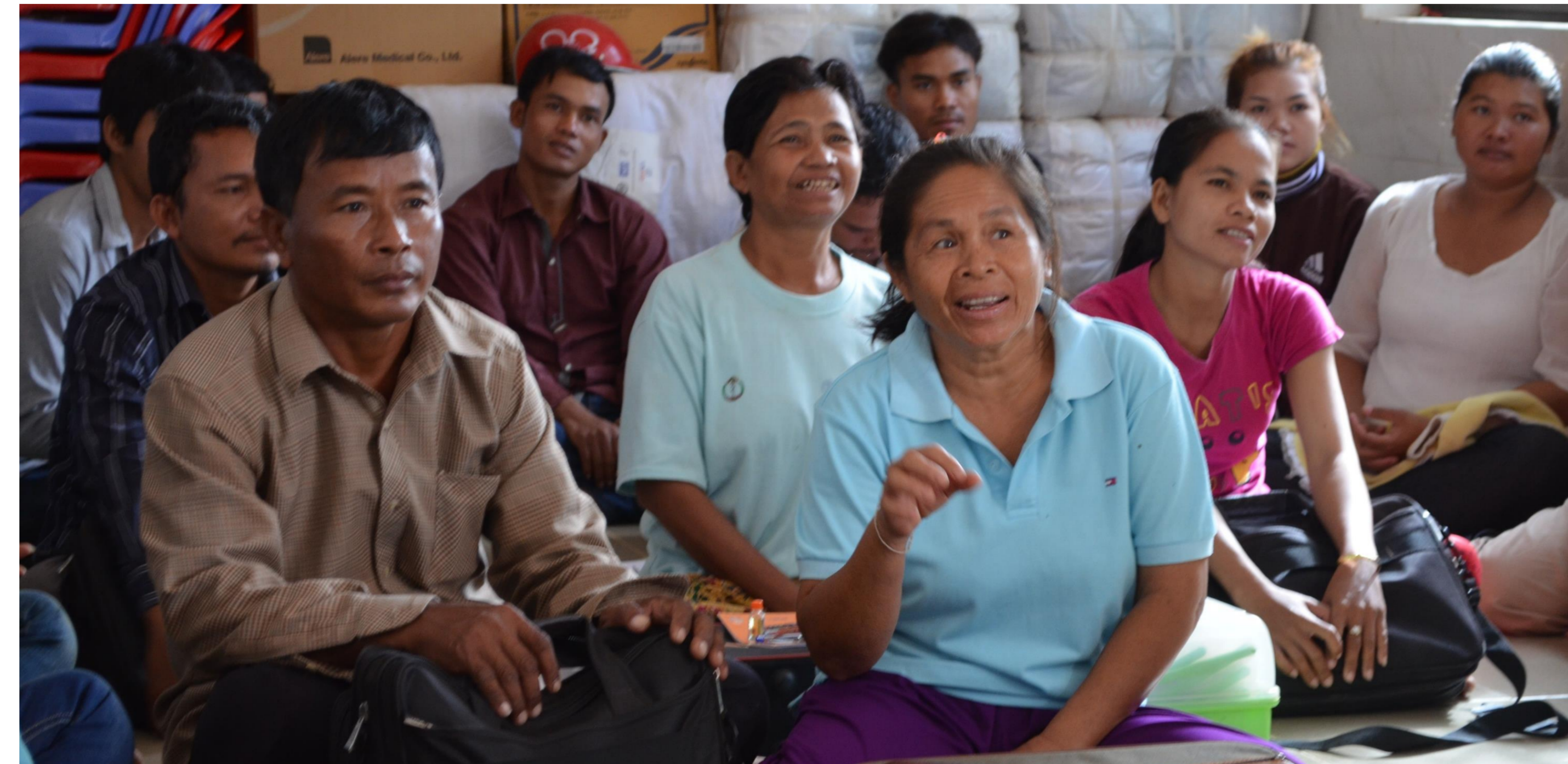
Village malaria workers meeting in Pailin, Cambodia.