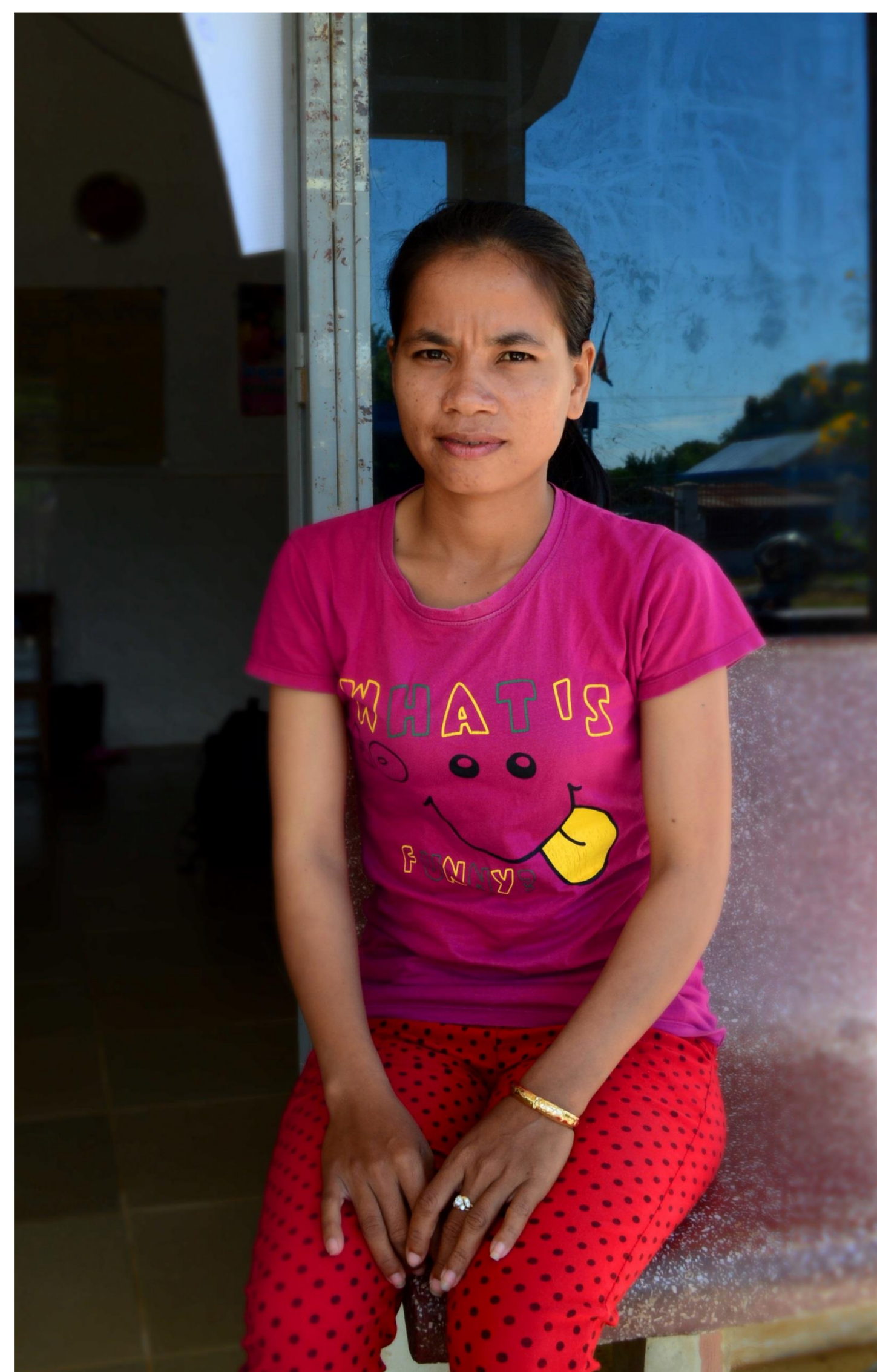
An FHI360 trained MMW participates in a joint cross border screening project and receives training (above).