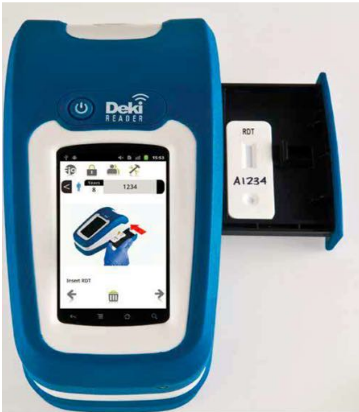
Fig 1. Deki Reader.

RDT procedure. The DR (Fig 1) then transmits all data, including a high-resolution image of the RDT to a cloud-based database in real time. In the secure portal, information from the field is displayed to show results in a custom dashboard of key performance indicators. The diagnostic performance of the DR has been proven to be comparable to visual interpretation [13, 14], with a sensitivity and specificity of 93.9% and 98.7% respectively for Plasmodium falciparum when compared to the gold standard [14]. We customized the device to allow the